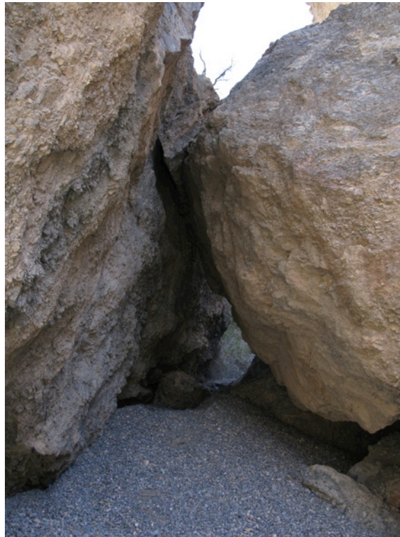
More impressive canyon walls: