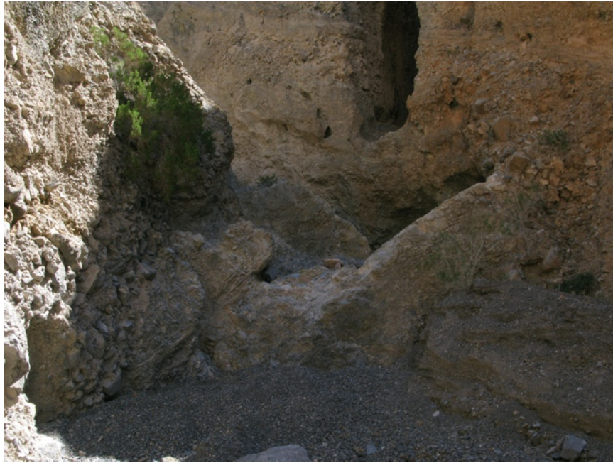
A boulder fallen in the wash that we walk underneath: