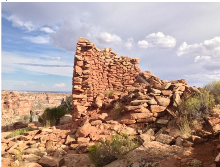
One of the Mule Canyon Towers, in Bears Ears National Monument.