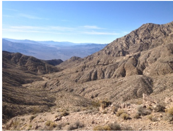
Panorama of Upper Scotty's: