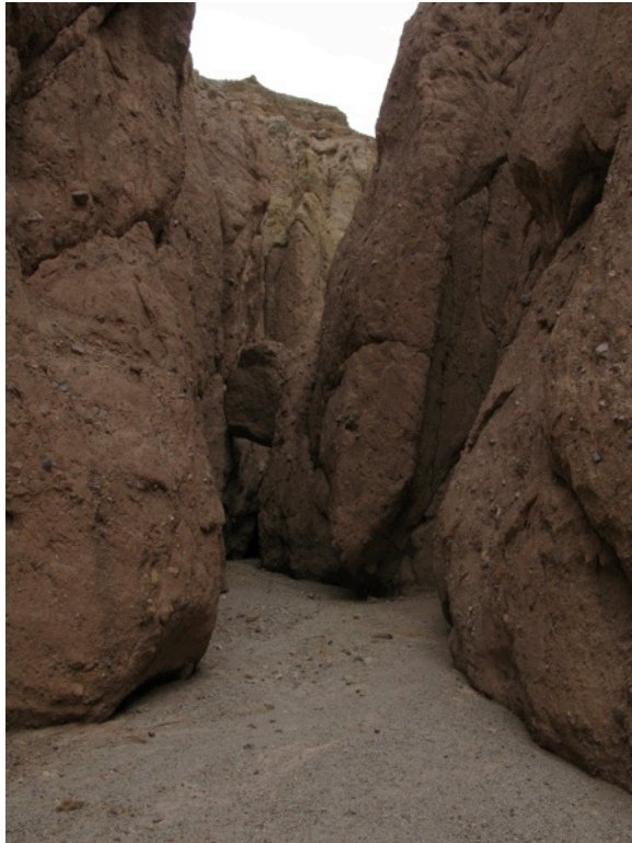
The Room of Room Canyon: