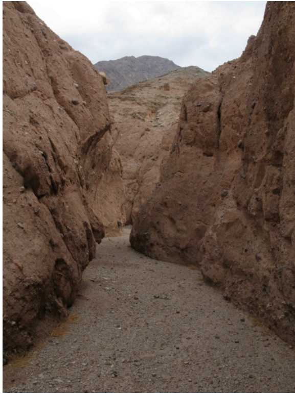
The canyon walls get taller and steeper: