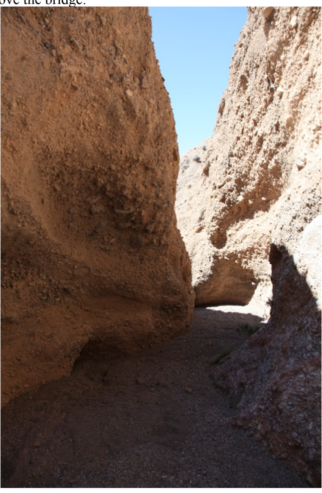
A boulder which must be climbed a little further on:

The short mud-narrows stretch above the bridge: