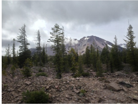
Photo of the Chaos Crags on our way to the trailhead for Paradise Meadow:

A view of Mount Lassen from the trailhead for Paradise Meadow: