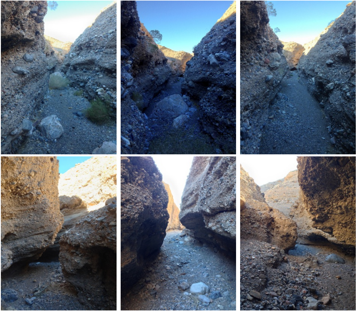
Looking up out of these narrows, which had much taller walls than I had expected from looking at maps of this area: