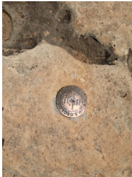
A less crowded viewpoint can be reached by following a use trail west from the main viewpoint: