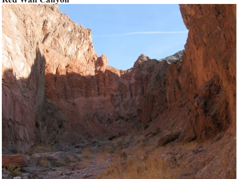
impressive red walls