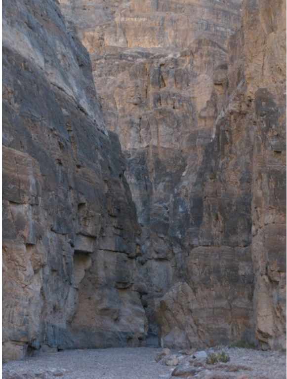
entering a narrow stretch of the canyon