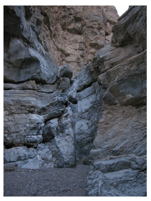
The 25-foot dryfall topped with a chockstone that we stopped at; we spent some time looking for a workaround but there didn't appear to be one.