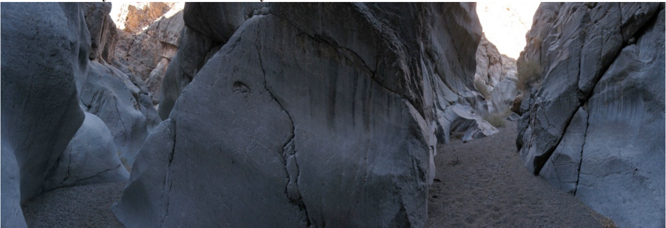
u-turn in the incredible narrows between the boulder jam and widowmaker dryfall

Undertaker Canyon and Widowmaker Dryfall