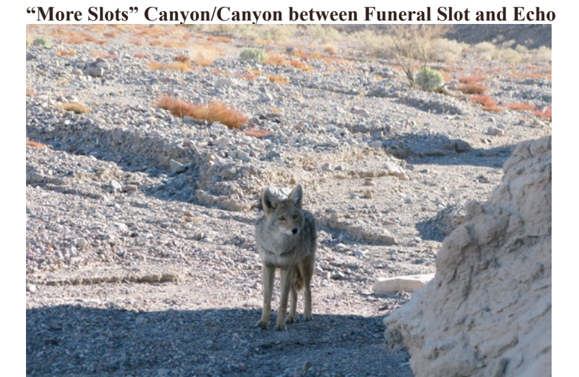
the local coyote