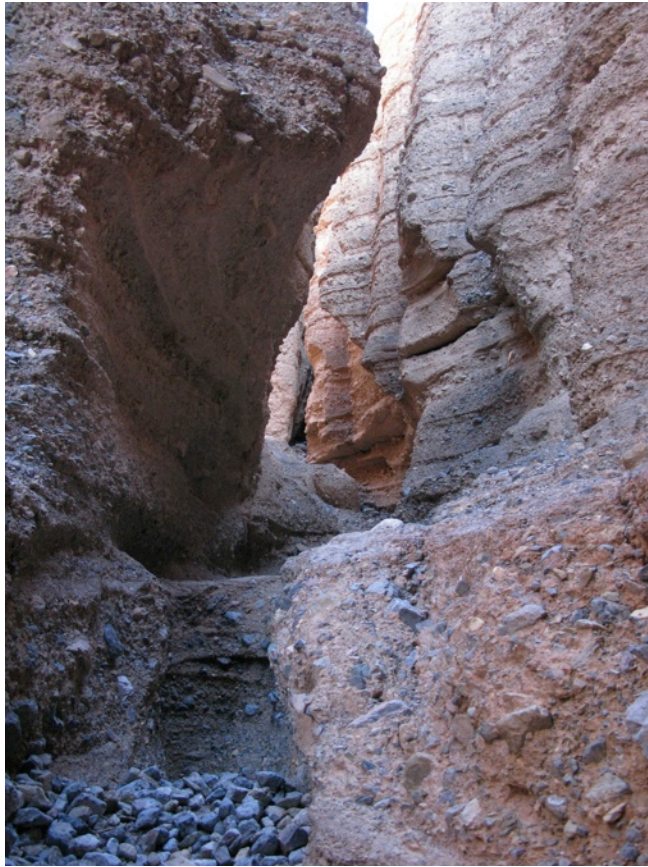
Mud drippings on a wall of the canyon: