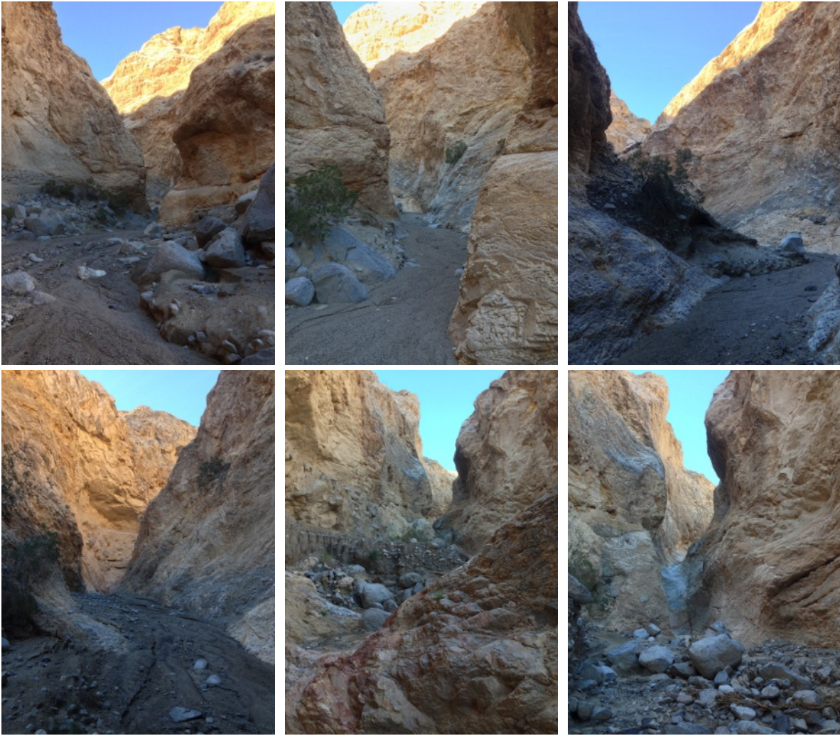
Interesting hoodoos in this narrow section: