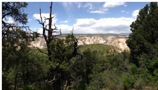
Panorama looking north from somewhere on the East Rim trail on the way back: