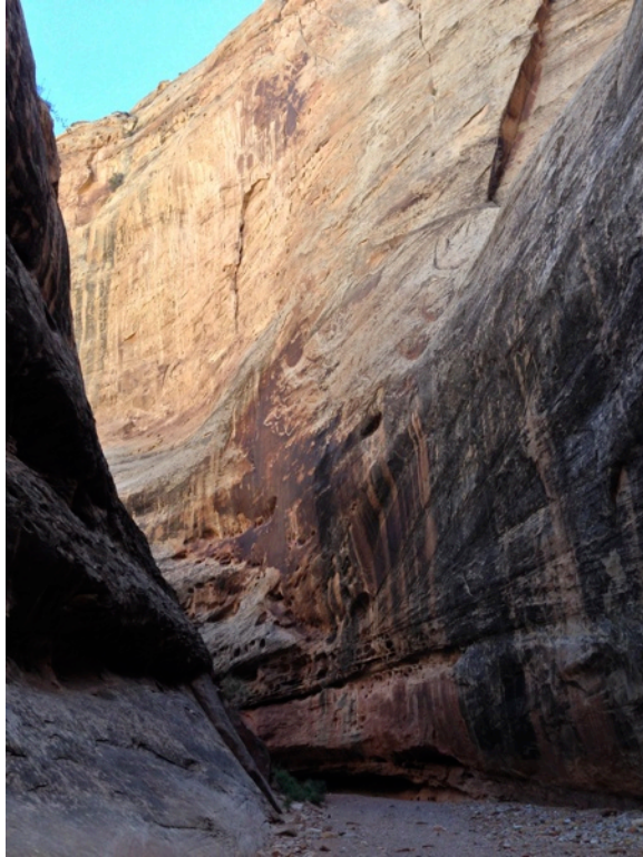
Typical view in the upper part of this canyon: