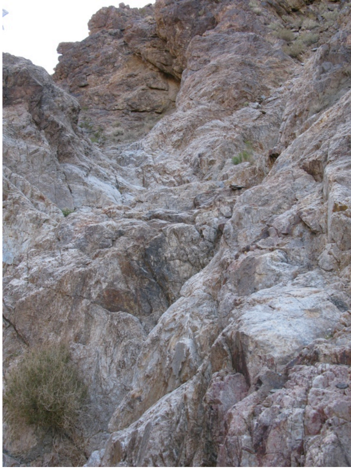
Interesting colored rock in the canyon: