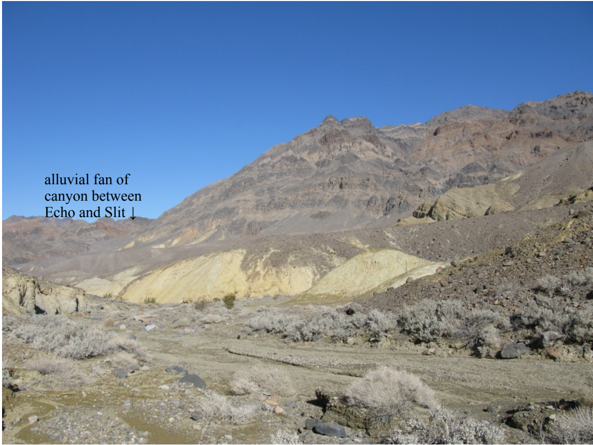
alluvial fan of canyon between Echo and Slit ↓