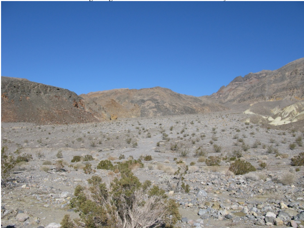
The beginning of the main alluvial fan for this canyon: