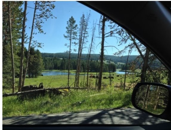
Yet another buffalo, this one just past the Fishing Bridge junction:

After we left the Mud Geyser area, we passed a large group of buffalo. It was interesting to notice on our return drive through this area that tourists would stop further north up the road to photograph a lone buffalo which was a large enough distance from the road that a substantial telephoto lens would be needed to get a good image. Often, a single buffalo would be a short distance down the road standing right next to the road, and around a couple of corners there would be a large group of buffalo, neither of which had as many tourists causing as large of a traffic jam as the single buffalo which could barely be seen. Hence some advice to wildlife photographers: there are enough buffalo near the road that the best photos will be obtained by searching out these buffalo, rather than waiting for one to appear in the distance. Also, if there is a large enough traffic jam being caused by rubbernecking tourists, park rangers will luckily appear to disperse the vehicles: